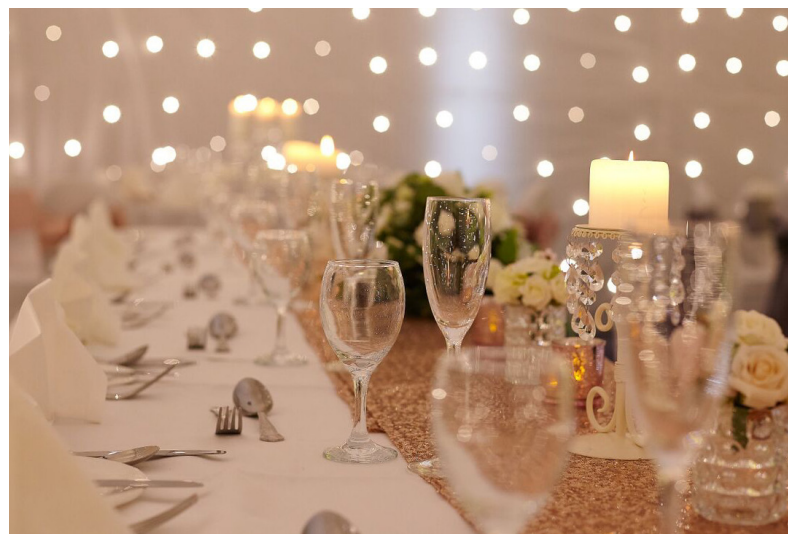
Top and bottom; photography courtesy of David Webb North East Wedding Photographer